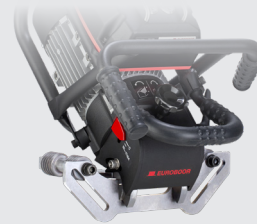
Stainless steel guide plate assembly Code: B60.1020S