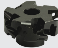
Milling head Code: B60.0027