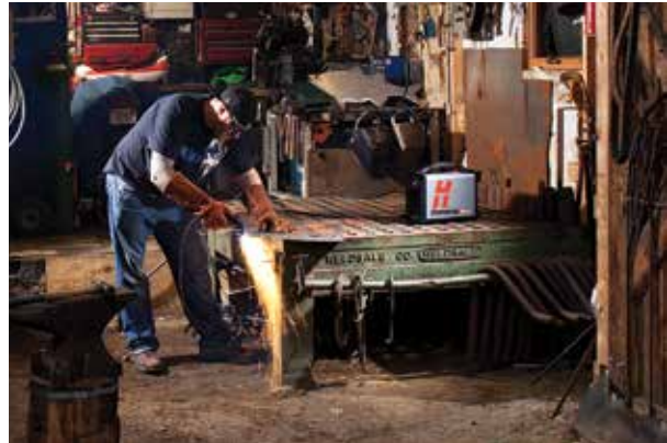
Home hobby and metal art

HVAC, agricultural, property/plant maintenance, fire and rescue, general fabrication, plus: