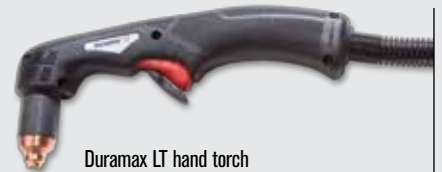
Duramax LT hand torch