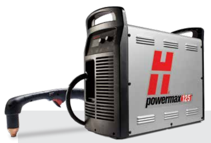
Duramax Hyamp standard torch styles (for more torch options, see www.hypertherm.com)