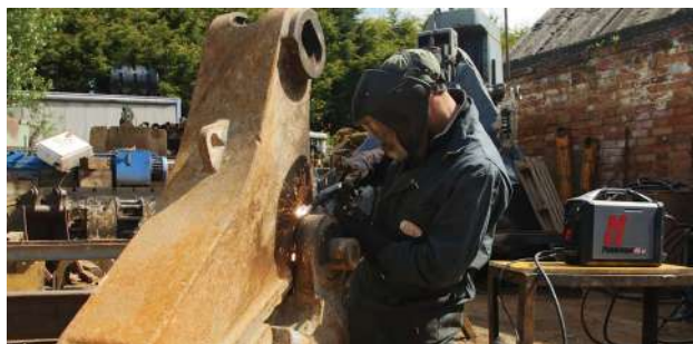
Maintenance and repair