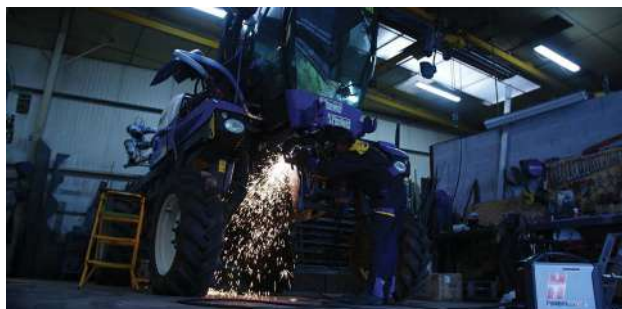
Agricultural and farm equipment maintenance